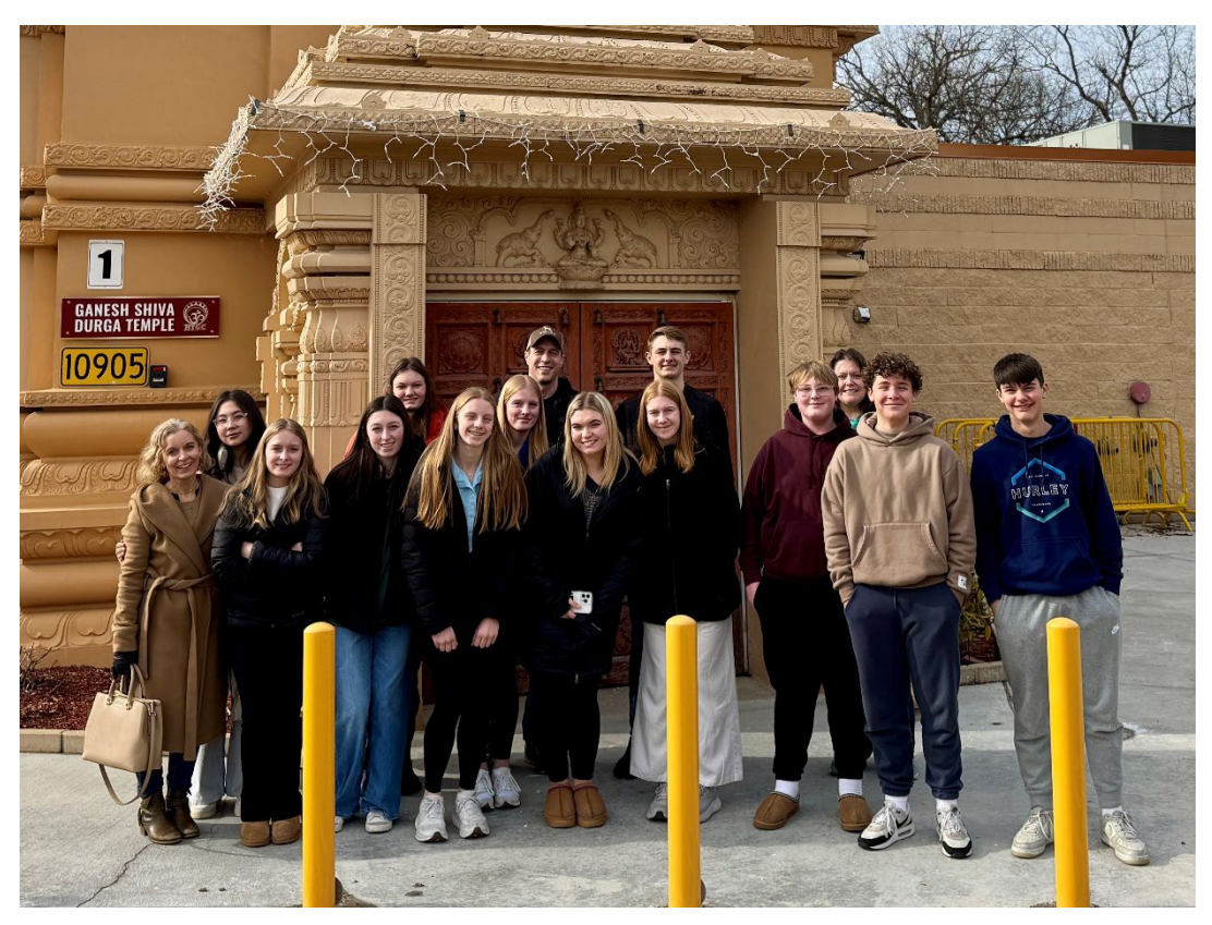
2025 High School Winter Retreat ~ We had a safe and wonderful weekend in Chicago!

Permission to stream the music in this service obtained from ONE LICENSE, #A-714899. All rights reserved. Permission to stream the music in this service obtained from CCLI, #20670260. All rights reserved.