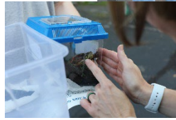
Blessing of the Animals